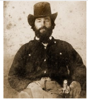
Br. Gen. John T Hughes

May 12th, 7:00 PM Camp Meeting Courthouse Exchange Restaurant 113 W Lexington Ave Indep, Mo 64050 Ok guys, we're going back to the Courthouse Exchange restaurant for this month. Speaker still to be determined as of press time. We'll come up with something good for you!